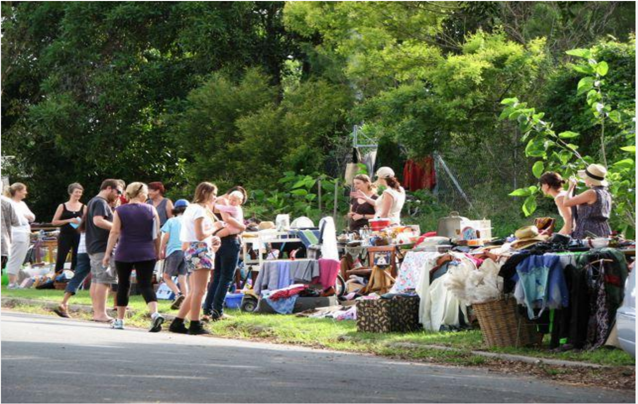
Community garage sale