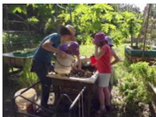
Earth Kids program