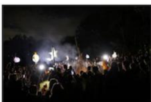
Winter Solstice Festival