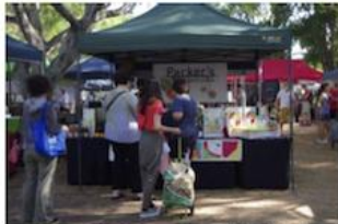
Organic Farmers Markets

16 Victoria St. Windsor Qld 4030. www.nscf.org.au