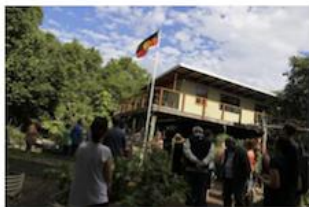
Flag raising ceremony