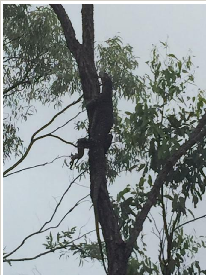
A big Goanna - In Aboriginal lore an unseen spirit that protects and guards